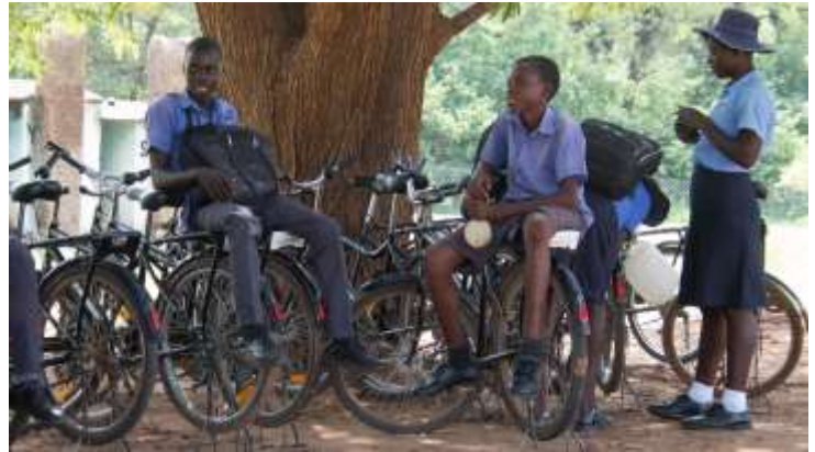
School is more fun with a bike – students at Muzarabani High