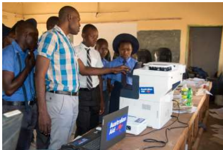
For further details and photos on the project see page 8.