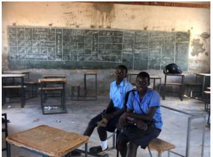
Girls at Muzarabani High – in between classes

At the rear of Muzarabani High's school ground. The dormitory is available to girls living far from school, without family or from difficult family situations such as domestic violence. They have to provide their own food supplies and do their own cooking. A female teacher lives next to the dormitory and provides supervision after school / during night.