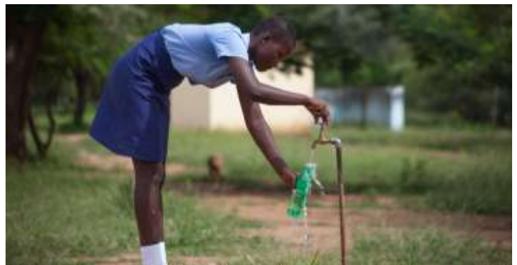
Water on tap - at Muzarabani High School