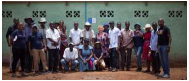
Guests at ceremony at Hwata Secondary: Representatives of Provincial Education Department, local Chief, local community, Principal of Hwata Secondary, Project Manager & Contractor with key staff, Rotary Club of Norwood and D9210 Harare