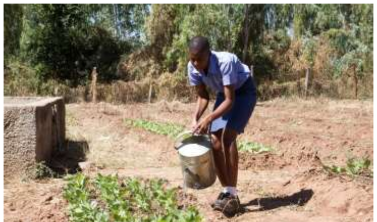
With water now available for irrigation, vegetables can now be grown in the school garden to supplement school meals.