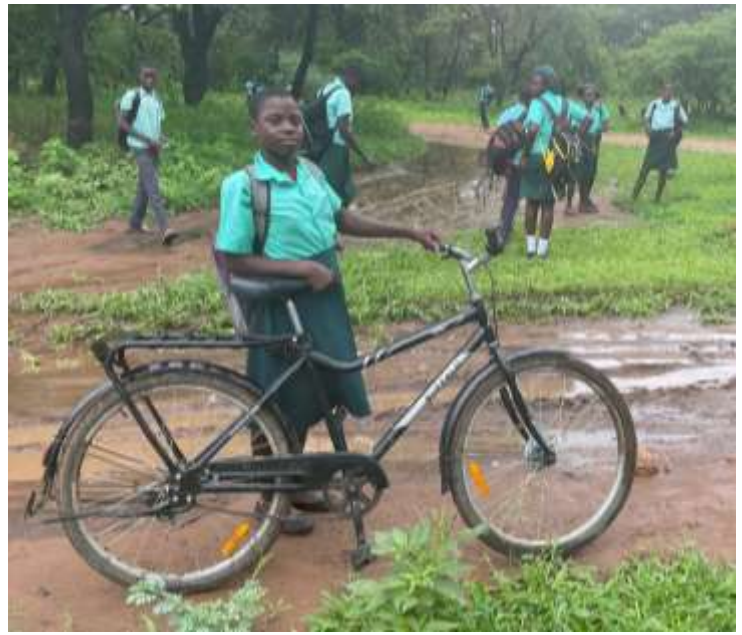
Tough bikes, "Buffalo Bike" for tough conditions – Hwata Secondary

The heat, very early starts to the day and long walks to school take their toll on students' capacity to concentrate