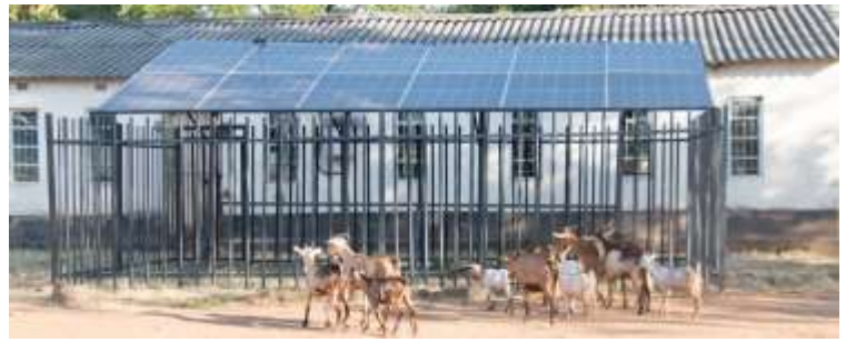
Solar panels mounted and fenced to protect from livestock

We thank the Australian Embassy and ultimately, the Australian Government and Australian Taxpayers for having laid the foundation for major educational advancements.