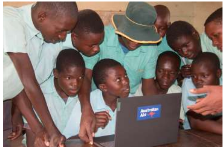
Excited students at Hwata Secondary