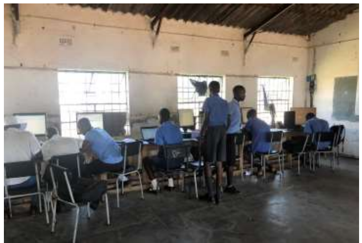
Computing Lab at Muzarabani High, picture taken in March 2022. Of the 5 desktop computers pictured, all around 15 years old, only 3 continued to operate in Feb 2023.