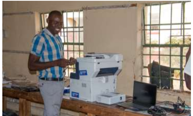
Printer (high volume capacity) being installed at Muzarabani