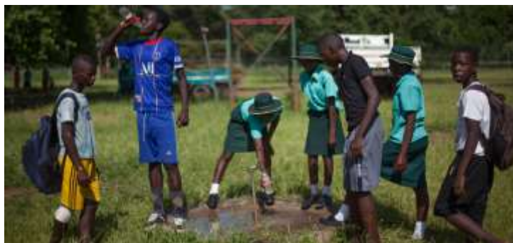
Sportsday, 10 Feb 2023 at Hwata Secondary with around 1,000 students from schools across the district participating – throughout the day students were able to readily access safe drinking water For further details and photos on the project see page 7.