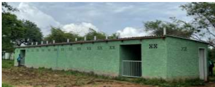
Student toilet block: for girls on left with 6 toilets and 1 shower, boys on right with 7 toilets plus urinals