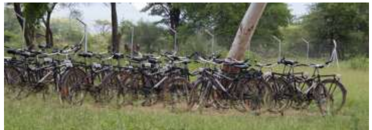
Bikes 'parked' during classes at Hwata Secondary