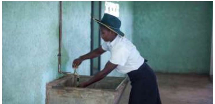
Handwashing basin –running water in school toilet blocks is locally considered as “above state of the art” for rural schools

With work completed the schools now benefit from: