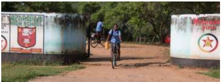
Girl student leaving Muzarabani High – on way home.