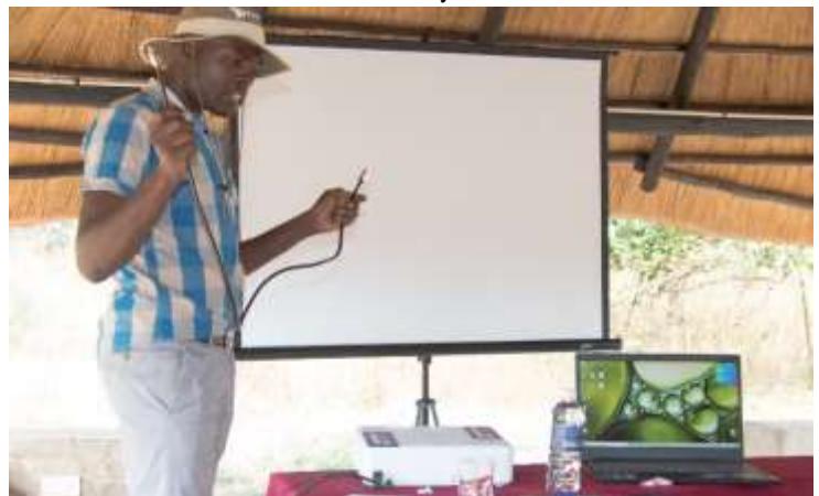
ICT-Teacher Training Workshop, 19 May